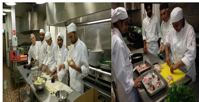
Trainer instructing students at Donald st Campus