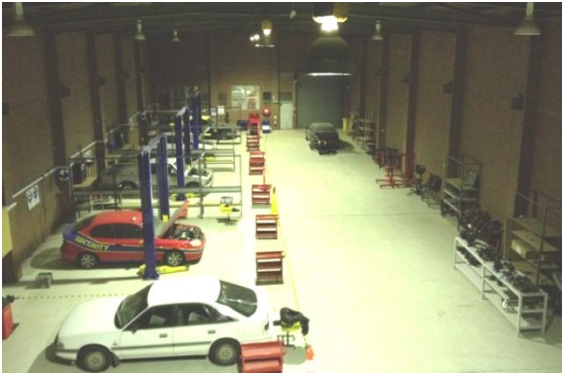
ACE Workshop at 347 Victoria street

ACE Kitchen at 149 Donald St, Brunswick East